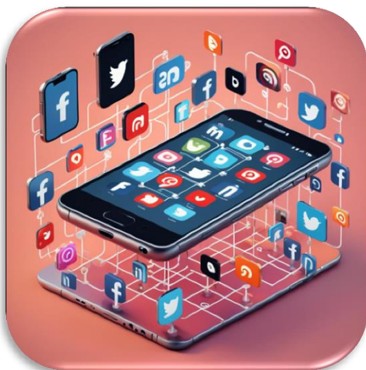
Fig 2.1 Application of AI in Phones