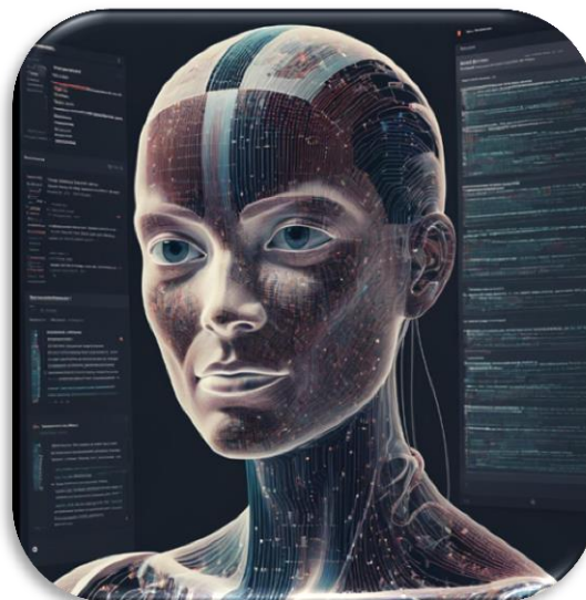
Fig 2.2 Application of AI in Robots