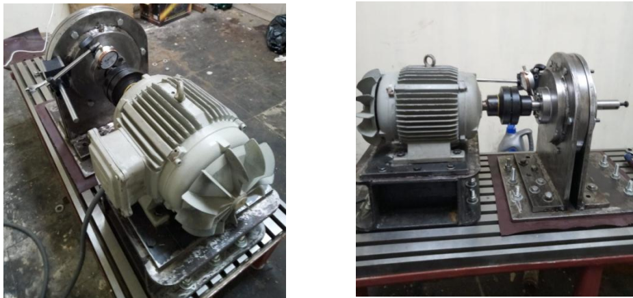
Figure 6: Alignment of connecting shafts of planetary gearbox

The gearbox has been connected to the electrical motor with a coupling, the alignment of the two shafts of motor and gearbox has been checked with a dial indicator as shown in Figure 6. The gearbox has been tested for rotating with variable speeds using tachometer. Experimental work has done to check the work of the gearbox and gear ratio