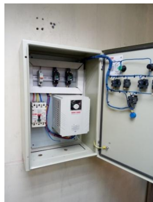
Figure 5: Control unit

An electrical control unit has been assembled and fastened to control the operation of the drive motor and varies its speed using inverter as illustrated in Figure 5. An electrical motor of 5 KW has been used as the driving source in the test rig.