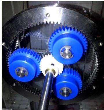
Figure 1: Planetary Gear train