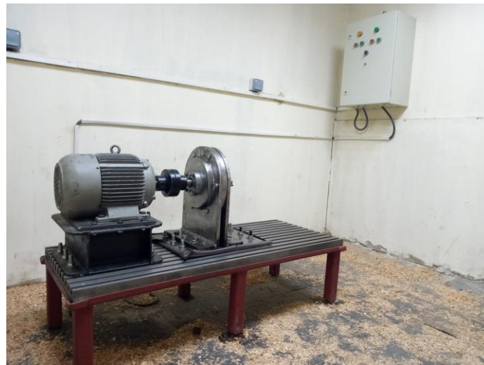
Figure 7: Power transmission elements test rig

The following Figure 7 illustrates the power transmission elements test rig after constructing