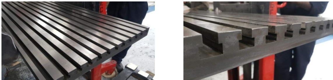
Figure 4: Manufactured T-Slot base plate

The design of the T-Slot base plate has been done carefully to permit fastening adequate number of instruments required for achieving the testing of different parameters during operation of power transmission elements. The T-Slot plate has been tested for any bubbles or cracks inside the material after manufacturing. Also a steel base for carrying the T-Slot base plate has been designed and manufactured.