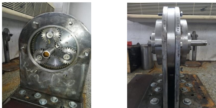
Figure 2: Planetary gearbox

A Planetary gearbox has been designed and manufactured for small industrial applications with gear ratio 4.5 and input speed of 1500 rpm. The basic equations and formula that determine the different parameters of the gear geometry are used. The housing of the gearbox has been designed and manufactured and the gearbox components have been assembled with the gearbox as shown in Figure 2.