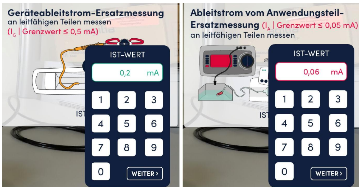
Figure 3: Electrical safety test with displayed limit values (Grenzwert)

For the electrical safety test, the medical technician must measure the following electrical values according to IEC 60601/EN 60601 [6]: Protective Earth Resistance, Earth Leakage Current, Touch or Enclosure Leakage Current, Patient Leakage Current, Patient Auxiliary Leakage Current and Mains on Applied Part Leakage Current. The medical device can only be used on the patient once all electrical measurements are within the specified limits. By displaying the target values via the AR-glasses, the medical technician can quickly compare the actual- and target values to release the Infusionpump for use on patient or to send it for repair. Figure 3 shows example measurements (Total device leakage current left and Applied Part Leakage Current right) with measured actual values and displayed limit values, displayed through the AR-glasses.