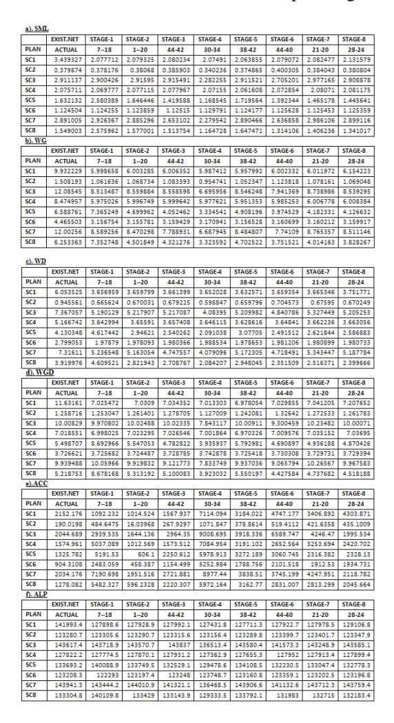
Table V (a-f). Values of SML, WG, WD, WGD, ACC, and ALP in different scenarios and different stages of planning.

It is assumed that all above scenarios have the same occurrence degree. SML, WG, WD, WGD, ACC, and ALP are used as planning criterion. In other word, SML, WG, WD, WGD, ACC, and ALP are used as cost function of risk analysis. Table V (a-f) shows the values of SML, WG, WD, WGD, ACC, and ALP in different scenarios and different stages of planning. (a) Values of SML when different criteria are used for planning. (b) Values of WG when different criteria are used for planning. (c) Values of WGD when different criteria are used for planning. (d) Values of WGD when different criteria are used for planning. (e) Values of ACC when different criteria are used for planning. (f) Values of ALP when different criteria are used for planning.