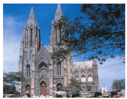
Fig.5: St. Philomena Church

Spires or long tapering roof-like elongated pyramids that are commonly found in churches are the typical characteristics of gothic style. The main hall or nave with multiple molded columns culminates in stately arches which guide the eye to the vaults. The altar is set against arched screens of stone works which are in harmony with the arched vertical lines and tapering vaults of the structure.