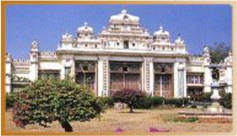
Fig. 4 Jagan Mohan Palace

The Jaganmohan Palace is example of predominantly Hindu traditional style. All temples in Mysore exhibit the traditional Hindu style of architecture. Each temple has a Garbhagruha, Sukanasi, Navaranga and Mukhamantapa. The agrahara houses are examples of traditional style with a simple but functional structure placed shoulder to shoulder with shared masonry walls.