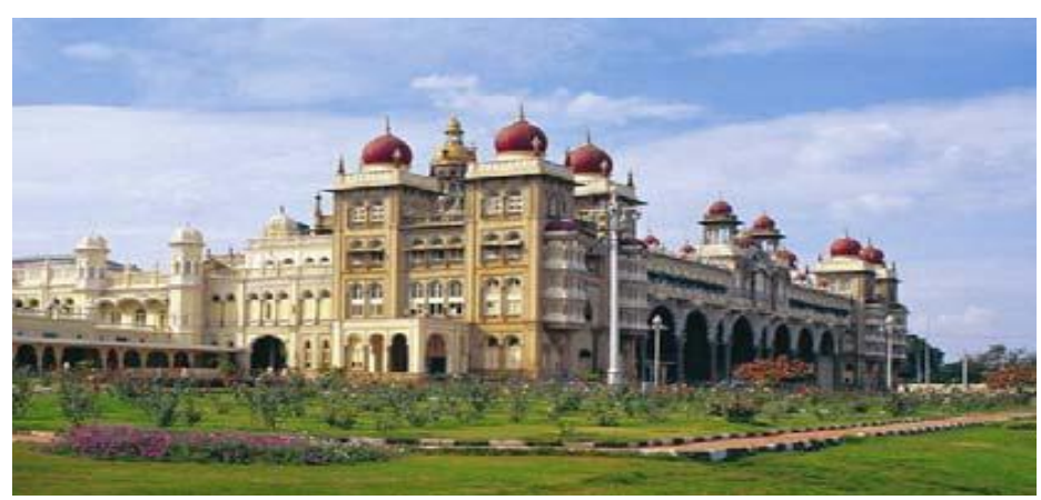
Fig.2 Ambavilas Palace

Amba Vilas Palace is an Indo-saracenic building and its styling was an occasional departure from the long-lasting vogue of the European, they yet have a compelling presence in the city's remarkable heritage of architecture.