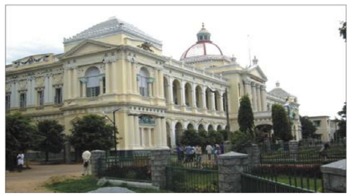
Fig.5 K.R. Hospital

In these structures a Vatican dome rising on a drum (Circular, Octagonal etc.) dominates the elevation. The column styles could be Tuscan, Ionic and Corinthian; arched and plastered colonnades form the two wings. Greek deities define the tier and the balustraded parapet bends are an agreeable addition to a rich composition. The Deputy Commissioner's Office (Dewan's Kacheri) Chaluvamba Park and the Krishna raja Hospital are classic examples.