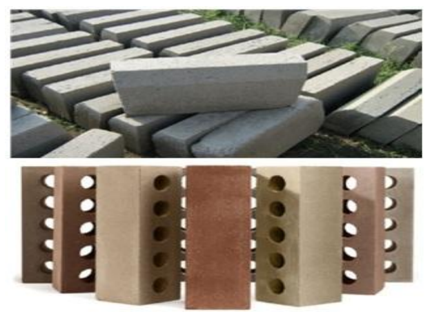
Figure-1 Fly ash using for making bricks

Orissa Government in India has banned the use of soil for the manufacture of bricks up to 20 km. of a thermal power station. In the case of fly ash-clay fired bricks, a mixture of clay and fly ash is fired. The unburnt carbon of the fly ash serves as fuel for burning. Approximately 20-30% energy can be reduced by adding25-40% fly ash [14].