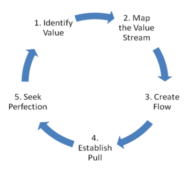
Fig. No.1 Principles of lean

• As value is specified, value streams are identified, wasted steps are removed, and flow and pull are introduced, begin the process again and continue it until a state of perfection is reached in which perfect value is created with no waste.