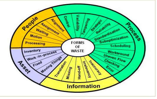
Fig. No.3 Forms Of Waste

Is a traditional Japanese term for an activity that is wasteful and doesn't add value or is unproductive, etymologically none or un-useful in practice or others. Muda has been given much greater attention as waste than the other two which means that whilst many Lean practitioners have learned to see muda they fail to see in the same prominence the wastes of mura(unevenness) and muri (overburden).