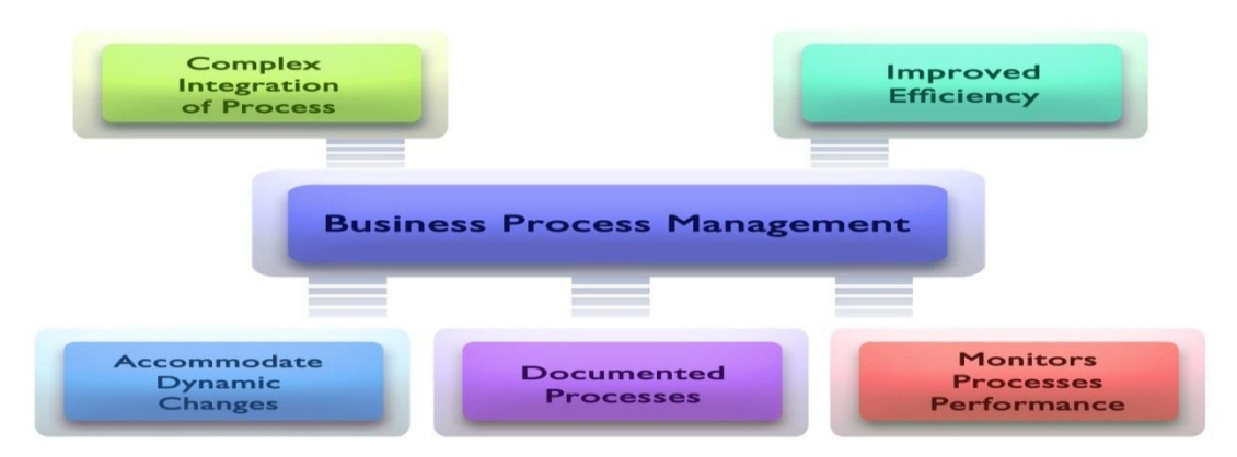
Figure [1] Benefits of using Business Process Management System

Business processes are the main core of today's and tomorrow's enterprises. Enterprises must be ready to focus on their business processes in order to improve the quality of their services. Due to the importance of modeling the processes, many business process modeling techniques and tools have been introduced in the research society and the market. Figure [1] presents the benefits of using BPM system for an enterprise.