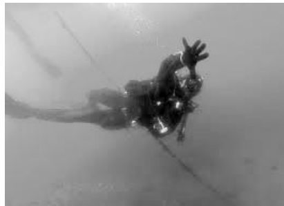
Figure 4 luminance map

LUMINANCE WEIGHT MAP: This map come through the luminance gain in the output image. This map explain the standard deviation between every R, G, B colour channels and each pixel luminance L of the input. Here the two input images are regenerate from RGB HSV space, for the component of V is the component of luminance .the luminance weight map plays a key role of balancing the brightness.