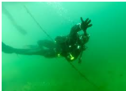
Figure 1original image

There are several methods and strategies to restore the degraded image. The degraded image can be Enhanced by different complex techniques which are not much efficient. The image can be restored by using multiple images [1], specialized hardware [2] and by using polarization filters [3]. Though, these techniques have produced effective results on underwater images, they are not efficient concerned to practicability. The Hardware techniques like using camera can deal with dynamic scenes but it is trouble-some, expensive and complex. The multiple image methods requires many images in different environmental conditions while polarization requires several images that have different degrees of polarization.