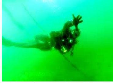
Figure 6 contrast enhanced image

Image fusion: In the last step we have implemented a multi scale image fusion. Image fusion is a process in which the inputs are weighted by exact computed maps to preserve the most important perceived features. The main aim is just to combine the input weights various maps. In this approach we are combining the input data in a per pixel manner to minimize the loss of the image structure. Now we got two images as inputs, we have to extract the three weight maps for each individual image, they are :