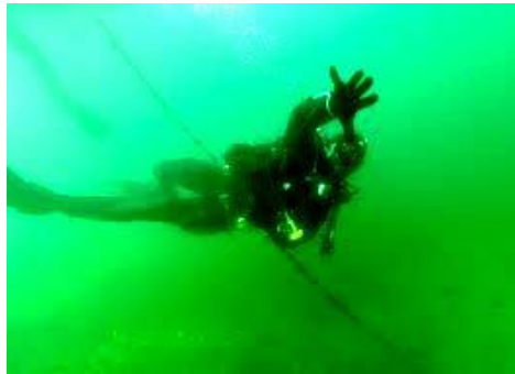
Figure 2 white balanced image

This step can effectively reduce the significant difference between the brightness values and prepare for the next step of image enhancement. As a result, we get the first input image I1.