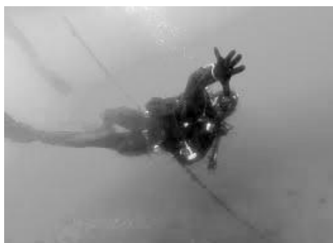
Figure 3 Chromatic map