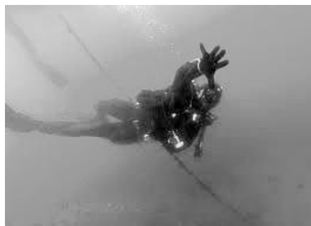
Figure 5 saliency map

Saliency weight map: The main aim of the saliency weight map is identifies the property with respect to the neighbourhood regions. The main information of the image is concentrated in only a small number of critical areas. This map reflects the distinction between a particular region and its neighbouring areas. If the area's distinction become more understandable, it will be easier to attract people's attention, and it will have greater impact. Different with the method in enhancing the global contrast which was mentioned previously, saliency map can make the edge of the original image to be highlighted. After extracting the contours of the local area. We increase the equivalent weight value, so as to accomplish the result of image distinction enhanced. Here, we use a newer method to generate Saliency map. They propose a regional contrast based Saliency extraction algorithm, which simultaneously calculates global contrast differences and spatial Coherence. The proposed algorithm is simple, efficient, and yields full resolution saliency maps .this algorithm is consistently beat current saliency detection method, yielding higher precision and better recall rates. This algorithm can produce the full-resolution map. It is better than the previous method. The example for the weight map is show in Figure below,