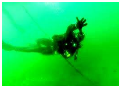
Figure 7 final result

Result: Here from the above discussion we are taking different under water images from different sources and process them by applying the corresponding weight maps we can get the final image as shown in the figure 7. At first we are white balancing the image so that we can avoid the unwanted colour casts during various illuminants. After that we are now applying the weights to our white balanced image. In our approach we can get a picture of an underwater image with good colour clear details of the background. When compared with other techniques the main structural alteration to our method is the amplified contrast. Our approach emphasize details without disturbing the colour. This technique requires very less computational means and is well appropriate for real time applications. Finally in our approach it shows a good strength to protect the consistency in the appearance of colour for various cameras.