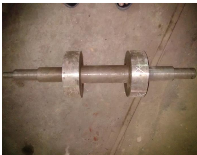
Fig. 02. Centrifugal casting machine shaft with roller (On site Photograph)