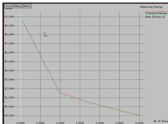
Fig. 1 Remaining Energy

This section presents the simulation results. The proposed approach has been simulated in NS2.35 and the results show the energy graph and the routing overhead comparison.