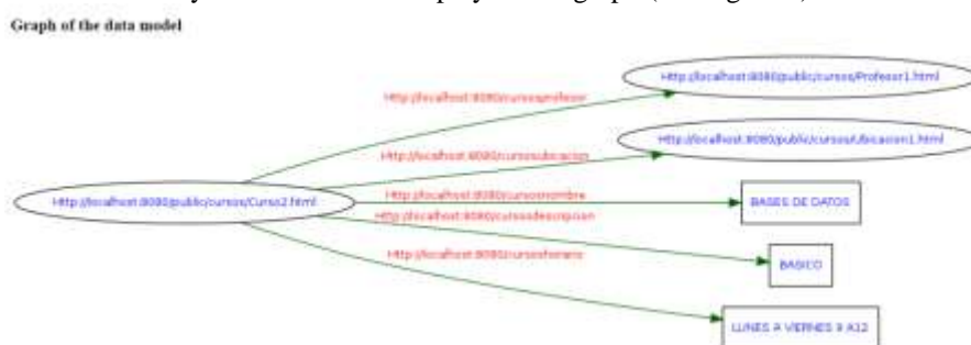
Figure 5 Representation of a course as a graph

The Generated information by the RDF can be displayed as a graph (see Figure 5).