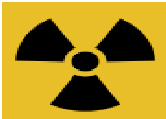
The radiation warning symbol

When radioactive contamination is being measured or mapped in situ, any location that appears to be a point source of radiation is likely to be heavily contaminated. A highly contaminated location is colloquially referred to as a "hot spot." On a map of a contaminated place, hot spots may be labeled with their "on contact" dose rate in mSv/h. In a contaminated facility, hot spots may be marked with a sign, shielded with bags of lead shot, or cordoned off with warning tape containing the radioactive trefoil symbol.