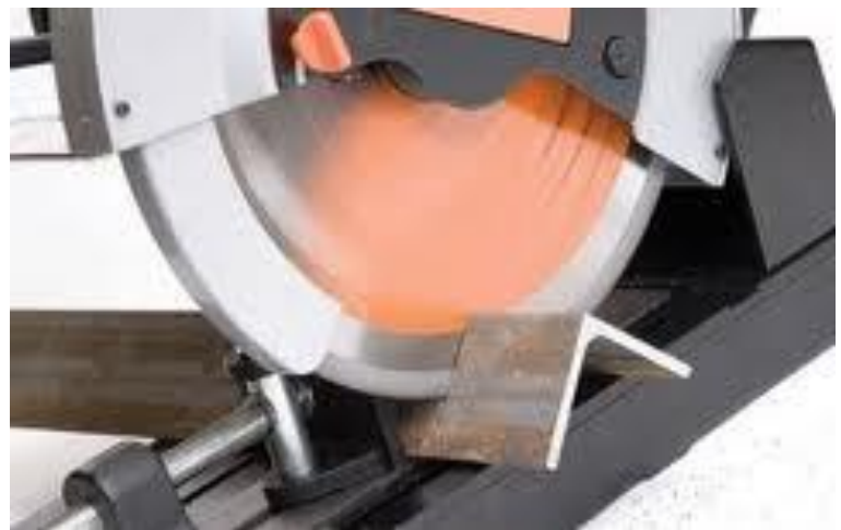
Fig. no 1.1 sawing operation

Cutting metal with a saw is similar to cutting wood with a saw. The main difference is that the cutting blade is thinner and the teeth are smaller. The