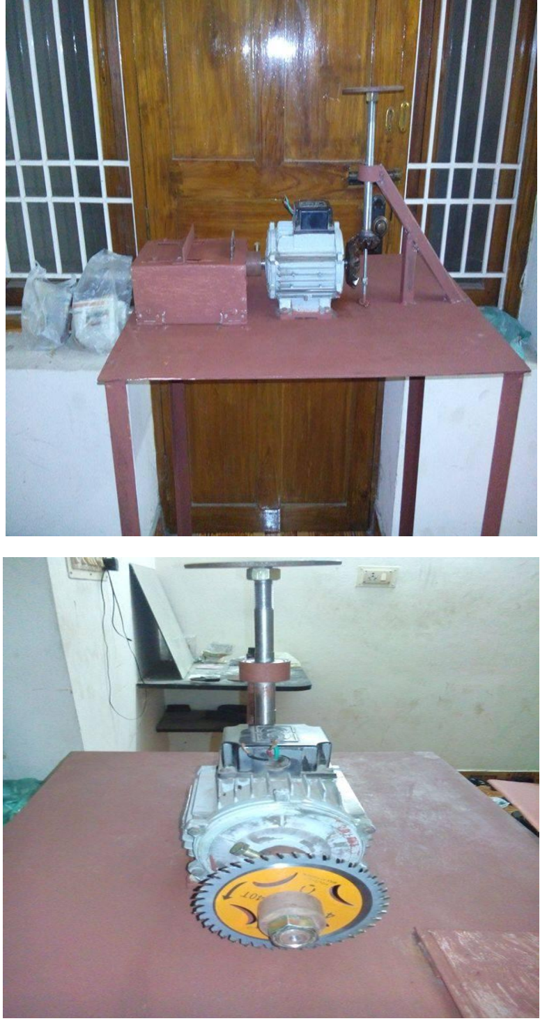
Fabrication of Cutting and Polishing Machine