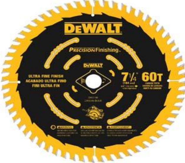
Fig.no 2.7 thin kerf

which is sharp and it cuts the materials.the kerf is placed on the tooth at certain angle which facilitates the cutting.