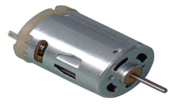
Fig.no 2.1 dc motor

A simple DC motor has a coil of wire that can rotate in a magnetic field. The current in the coil is supplied via two brushes that make moving contact with a split ring. The coil lies in a steady magnetic field. The forces exerted on the current-carrying wires create a torque on the coil.