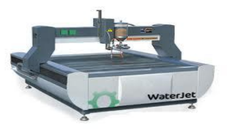
Fig.no 1.4 water jet cutting

Cuts are clean and accurate using a waterjet process. The cutting produces no heat to affect the metal, eliminating the need for grinding. Water from the cut is collected underneath, filtered and reused in the cutting process.