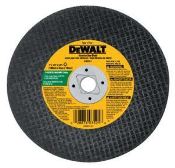
Fig.no 2.8 abrasive cut-off blade

Protective arbor inserts are supplied on resin and rubber/resin blades. All blade arbor holes fit BOTH 32 mm and 1-1/4" spindle arbors. All blades are precision ground to slightly less than the stated diameter to universally fit all makes and models of cutting machines. Blotters are supplied to shield vibration from the metal flange and help protect the blade from breaking during use.