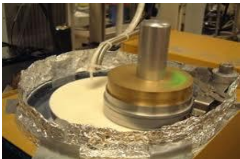
Fig.no 1.8 mechanical polishing

For moderately tarnished steel, consider mechanical polishing. A rag wheel or a power buffer gets quick results. Put a coat of special polish on the item, then use the power buffer to lightly apply pressure. When using such equipment, make sure all hair, jewelry, etc., are out of the way. Wearing eye protection is a good idea.