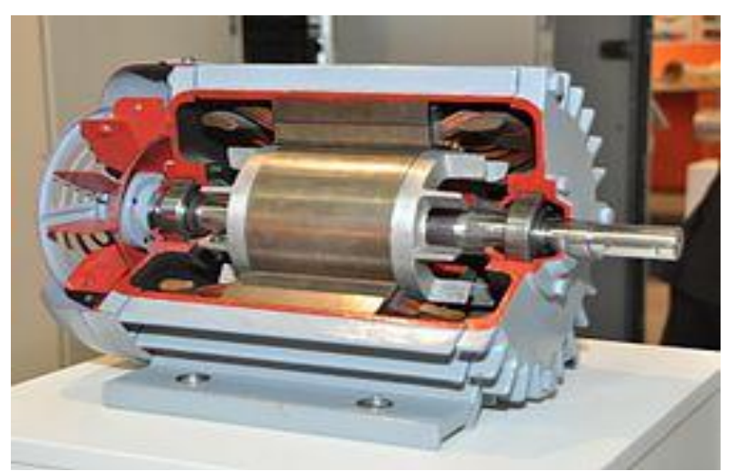
Fig.no 2.3 induction motor

An induction or asynchronous motor is an AC electric motor in which the electric current in the rotor needed to produce torque is induced by electromagnetic induction from the magnetic field of the stator winding. An induction motor therefore does not require mechanical commutation, separate-excitation or self-excitation for all or part of the energy transferred from stator to rotor, as in universal, DC and large synchronous motors. An induction motor's rotor can be either wound type or squirrel-cage type.