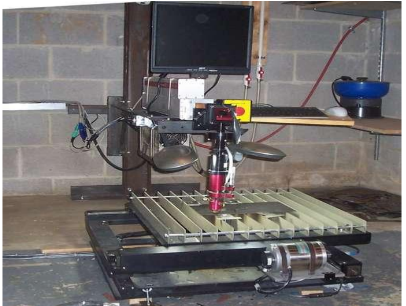
Fig.no 1.5 laser cutting operation

Laser cuts hit the metal with a tightly focused laser beam that heats the metal and forms a melt capillary (a tube with a very small diameter) through the metal. A jet of gas ejects molten metal from the back of the steel during the cuts. Cuts are accurate, with no need for finishing off the edges before welding is done.