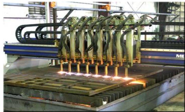
Fig.no 1.2 Flame cutting operation

Flame-cutting equipment consists of a nozzle connected to hoses that connect to tanks of gas. Most often the gasses are oxygen and acetylene. Regulating the pressure of the gasses using the pressure gauges attached to the tanks adjusts the temperature of the flame. Thicker steel needs a more intense flame to make the cut.