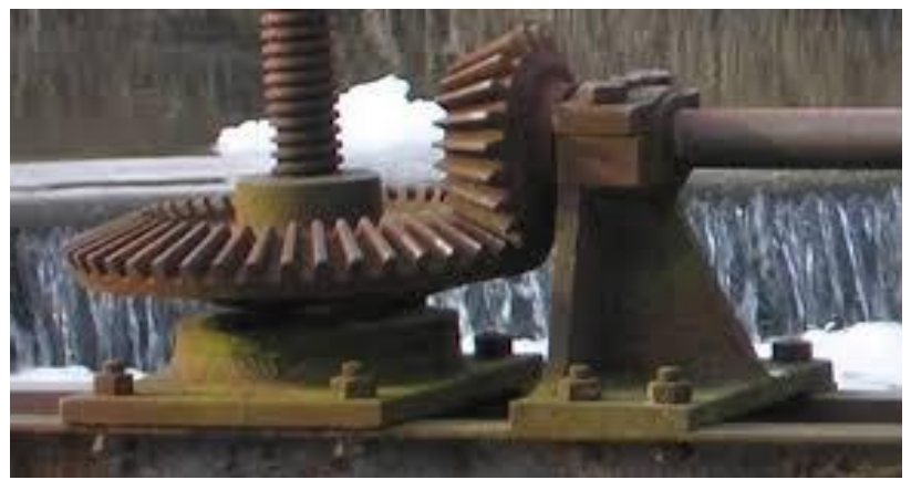
Fig 2.5 bevel gear