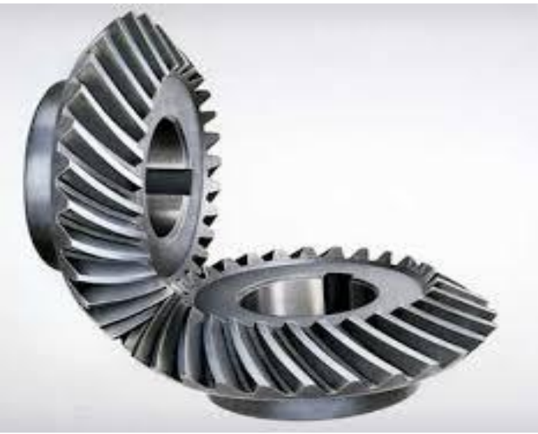
Fig.no 2.4 bevel gear

The most familiar kinds of bevel gears have pitch angles of less than 90 degrees and therefore are coneshaped. This type of bevel gear is called external because the gear teeth point outward. The pitch surfaces of meshed external bevel gears are coaxial with the gear shafts; the apexes of the two surfaces are at the point of intersection of the shaft axes.