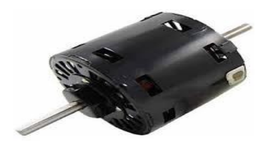
Fig.no 2.2 ac motor

The first thing to do in an AC motor is to create a rotating field. 'Ordinary' AC from a 2 or 3 pin socket is single phase AC--it has a single sinusoidal potential difference generated between only two wires--the active and neutral. With single phase AC, one can produce a rotating field by generating two currents that are out of phase using for example a capacitor. In the example shown, the two currents are 90° out of phase, so the vertical component of the magnetic field is sinusoidal, while the horizontal is cosusoidal, as shown. This gives a field rotating counterclockwise. In this animation, the graphs show the variation in time of the currents in the vertical and horizontal coils. The plot of the field components B_x and B_y shows that the vector sum of these two fields is a rotating field. The main picture shows the rotating field. It also shows the polarity of the magnets: as above, blue represents a North pole and red a South pole.