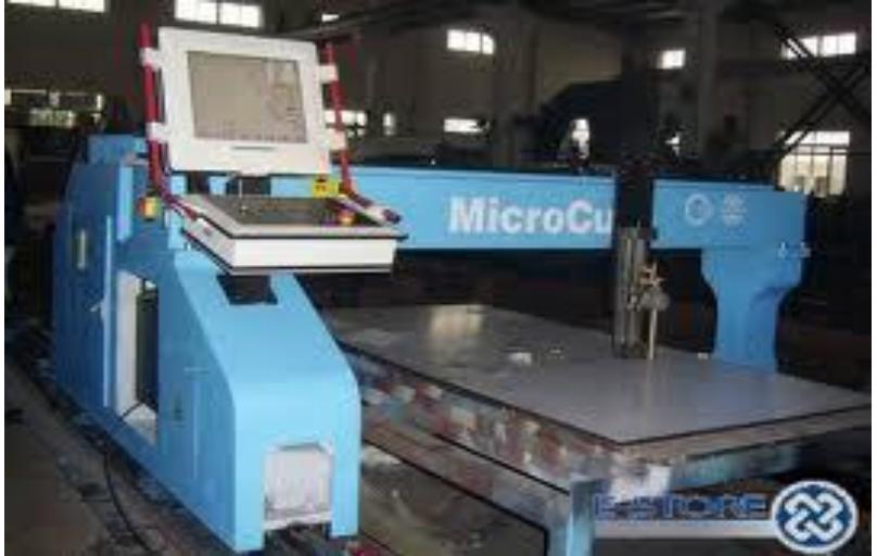
Fig.no 1.3 Plasma cutting operation

Plasma cutting starts by clamping a ground cable onto the sheet of metal. Compressed air or a gas such as nitrogen or argon is blown at extreme high speed out of the nozzle of the plasma torch, which contains an electrode. Moving the nozzle close to the metal creates a high-frequency electrical arc that travels through the compressed air, superheating it. The compressed air turns to plasma, a gas that has been energized to the point that some electrons break free. Adding more electricity makes the plasma hotter.