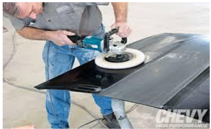
Fig.no 1.7 hand polishing

Those who wish to polish steel at home with household products have several options. First, for mildly stained steel, water may be all that is needed to restore the metal to a natural shine. Soak a clean cloth in warm water and wipe down the fixture that needs polishing. It is important to wipe the water with another clean, dry cloth before the water has time to dry. Microfiber cloths are best for this method.