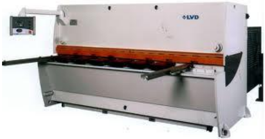
Fig.no 1.6 shear cutting

Thin sheets of steel like duct work metal can be cut using a foot press shear. Thicker metals need the force of hydraulics. Before the metal separates, it gets bent a little over the bottom die, which leaves a sharp edge that needs