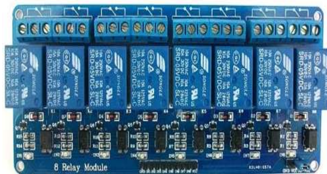
Figure 1. Relay

The relay is also widely used to control machines that work sequentially prior to the microprocessor technology available, for example in injection molding machines, blow molding and conveyor belt.