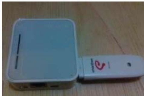
Figure 4 Modem Router

A router is a computer networking hardware that is used to divide the protocol to other network members. The router function generally is a link between two or more networks to carry data from one network to another. But different router with the switch, because the switch is only used to connect multiple computers and form a LAN (local area network). While routers are used to interconnect the LAN with other LAN.