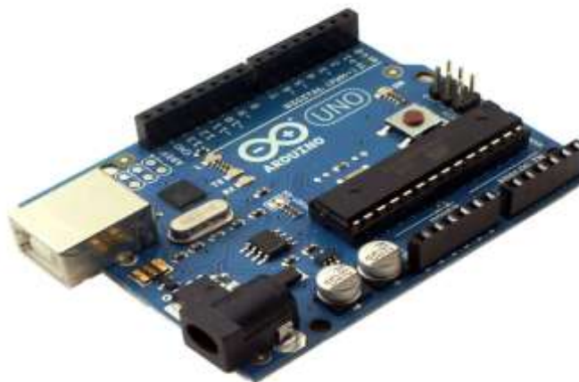
Figure 2 Arduino

Arduino is an open source electronic kits designed specifically for enabling everyone to develop electronic devices that interact with a variety of sensors and controllers. Arduino Duemilanove is a microcontroller board based ATmega 328. The board has a 14 pin microcontroller input / digital output (6 of them can be used as PWM outputs), 6 analog inputs, 16MHz crystal oscillator, a USB connection and ICSP header. Arduino Uno is a microcontroller board based ATmega 328. The board has a 14 pin microcontroller input / digital output, six of them can be used as PWM outputs), 6 analog inputs, 16MHz crystal oscillator, a USB connection and ICSP header, jack power, ICSP head and the reset button. Arduino is able to support the microcontroller; can be connected to a computer using a USB cable.