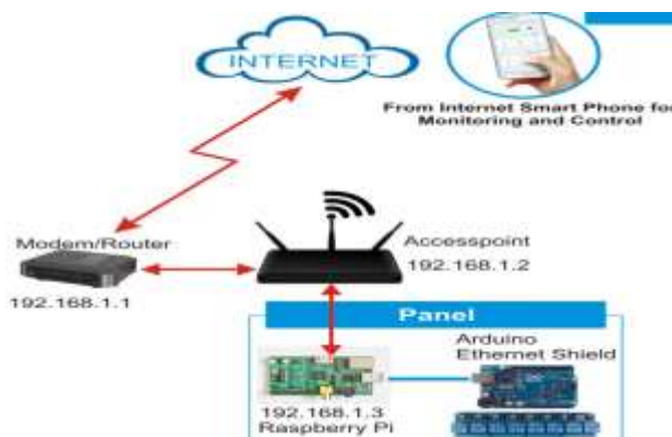
Figure 7 Control Uses The Internet

in the figure above is the development of local connections so that the user can control the electrical appliance (KKB, water pump machine, TV, electric lights and MCB) via an internet connection. in Figure 6 there and a modem / router that functions as a media liaison local and internet connection. so users can monitor and control the electric appliance the user must be able to access the address "http://www.penelitian-kendaligedung.ngrok.com" on a user's smartphone, the next page will appear on the website smartphone used as a remote user to send instructions to arduino whose function is to control the electrical equipment in a building or house.