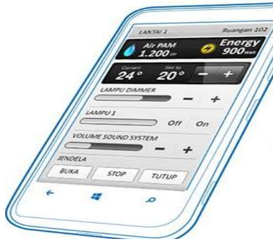
Figure 3 Smartphone