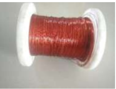
Figure 5:Electromagnetic Coil

(5) Electromagnetic coil: Electromagnetic coil is formed when an insulated copper wire is curl around the core or form to create the electromagnet. There are lots of turn curl around the cylinder which all together formed a solenoid. Coils are often coated with a varnish or wrapped with insulating tape to provide additional insulation and secure them in place.