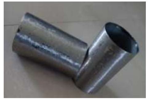
Figure 2: Cylinder

(1) Cylinder: The temperature within the electromagnetic engine cylinder is very low and so no fins are needed for heat transfer. These make the cylinder easily manufacturable. The cylinder is made of stainless steel, a non-magnetic material which limits the magnetic field within the boundaries of cylinder periphery.