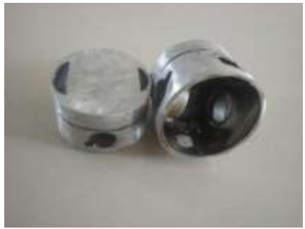
Figure 3: Piston

(2) Piston: The piston is the reciprocating part of an engine. The permanent magnet attached in the piston and the electromagnet attached in the cylinder creates a magnetic force which drive the crankshaft with the help of the connecting rod.