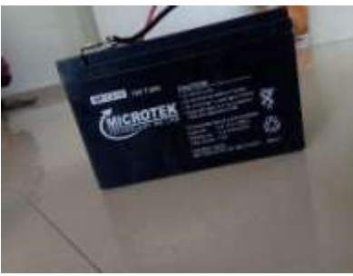
Figure 7: Battery (24V)

(7) Battery: Lead acid cell is the most commonly used type of battery when high value of load current is necessary. In this engine 24V lead acid battery is used. The lead-acid cell is the type most commonly used. The electrolyte is a dilute solution of sulfuric acid (H<sub>2</sub>SO<sub>4</sub>). In the application of battery power to start the engine in an auto mobile, for example, the load current to the starter motor is typically 200 to 400A One cell has a nominal output of 2.1V, but lead-acid cells are frequently used in a series combination of three for a 6V battery and six for a 12V battery