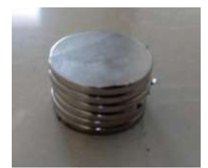
Figure 6: Permanent Magnet

(7) Battery: Lead acid cell is the most commonly used type of battery when high value of load current is necessary. In this engine 24V lead acid battery is used. The lead-acid cell is the type most commonly used. The electrolyte is a dilute solution of sulfuric acid (H<sub>2</sub>SO<sub>4</sub>). In the application of battery power to start the engine in an auto mobile, for example, the load current to the starter motor is typically 200 to 400A One cell has a nominal output of 2.1V, but lead-acid cells are frequently used in a series combination of three for a 6V battery and six for a 12V battery