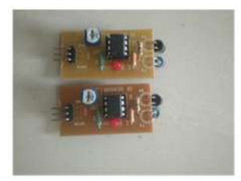
Figure 9: IR sensors