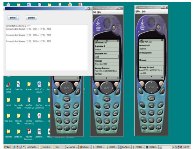
Figure 3: Edge Witnessing