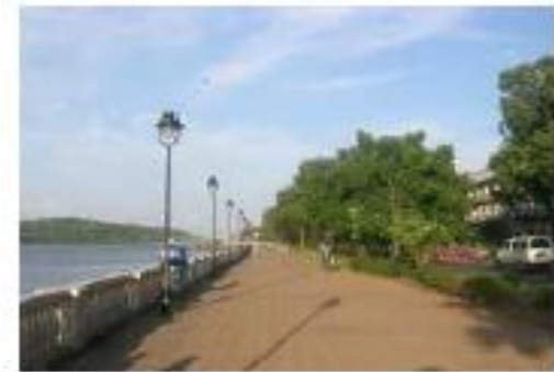
Fig.2 Modavi River Front