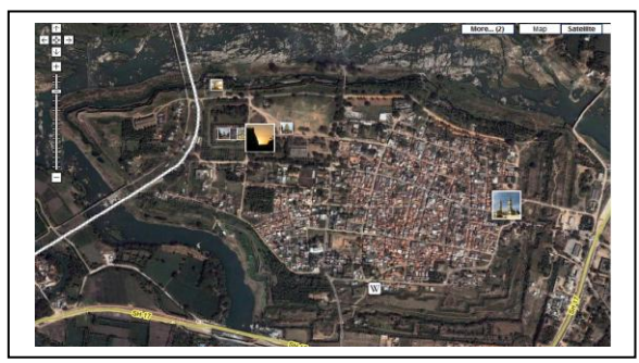
Fig.1: Aerial View of Srirangapatana Fort Area

The Fort is one of the principal elements to the character of Srirangapatna. The island of Srirangapatna is surrounded by a great stone fort wall that rises up sharply from the banks of the river Cauvery. The Srirangapatna Fort was constructed on the western end of the island in 1454 AD and is one of the most formidable forts in India. The fort was so formidable that a great military authority who visited it in 1880 A.D., pronounced it as the second strongest in India. The Fort, constructed on the western end of the island, is an irregular pentagon with a perimeter of about 4 k.m. The aerial view of Srirangapatna is as follows.