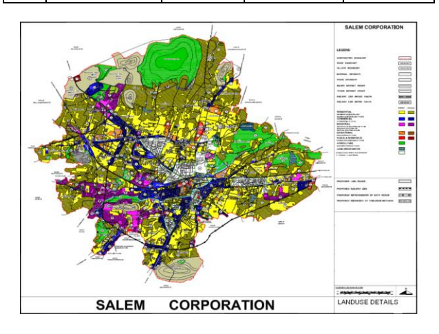
Figure.1. Existing land-use details of salem city corporation