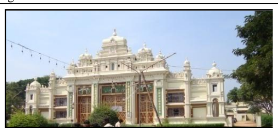
Fig.2: Jagan Mohan Palace

Jagan Mohan Palace building is the best example of traditional style of architecture in Mysore city. The visual effect of the edifice is enhanced by an appropriately deep foreground.