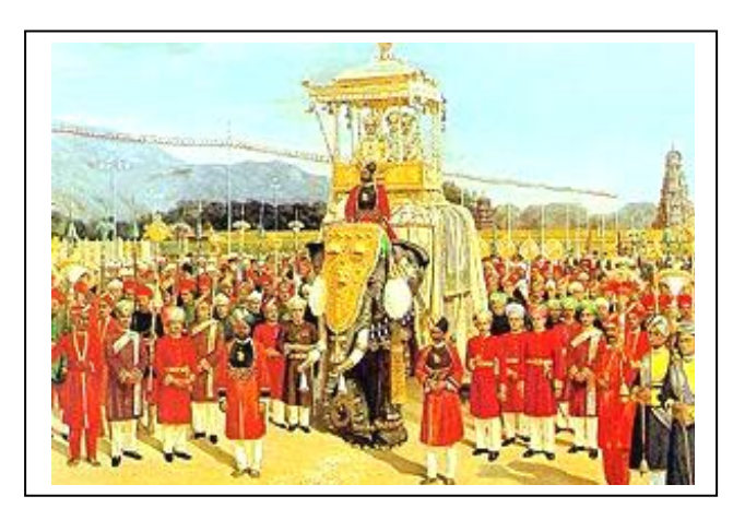
Fig. 8: Dasara Festival

Dasara festival has both mythological and historical background and has its origin in the great epic of Mahabharata. The legendary pandava brothers celebrated the festivals to mark of triumph of good over evil. They worshipped hidden weapons which are now being celebrated as "ayudha pooja". The Navaratri is associated with Devi Purnima, celebrated to mark the destruction of evil.