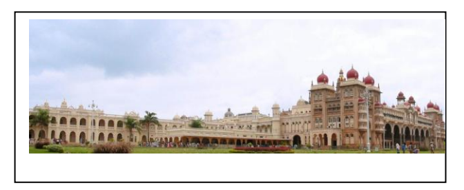
Fig.1 Ambavilas Palace

The Indo Sarcenic buildings of Mysore city is led by Ambavilas Palace. Mixtures of Hindu and Islamic characteristics of architecture are found in all these buildings. The Islamic architectural influences found in these buildings, which were used Islamic pointed and cusped arch openings found in the verandas, projecting minarets near the entrance portico, big bulbous domes in the centre and in the corners of the building on their roof level.