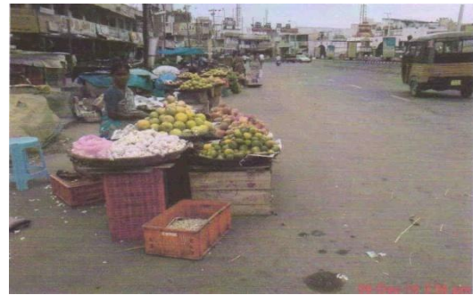
FIGURE.3. FOOTPATH & CARRIAGEWAY OCCUPIED BY THE MERCHANTS IN CBD AREA

the carriageway separated by non-mountable kerbs. Height of the kerb at the edge should, however, not exceed the height of non-mountable kerbs, as this might otherwise detract pedestrians from getting on to the side-walks. The width of the side-walks depends upon the expected pedestrian flows and could be fixed with the help of guidelines given in Table.3, subject to a minimum width of 1.5m Most of the footpath were occupied by the merchants (Figure.3.)