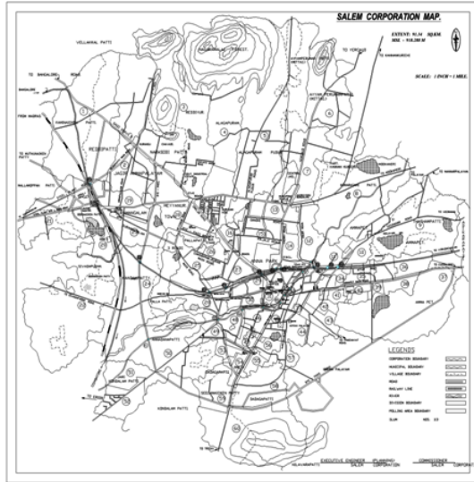
FIGURE.2. SALEM CITY CORPORATION ROAD NETWORK